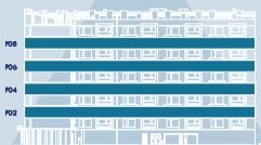
Plantas 1-3-5-7 y 9